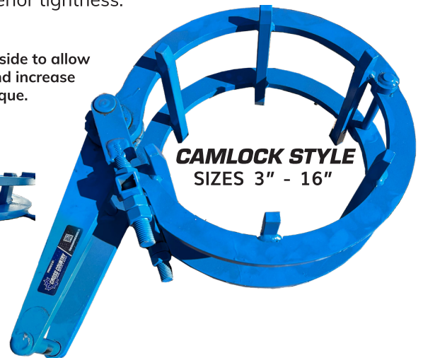
CAMLOCK STYLE SIZES 3" - 16"