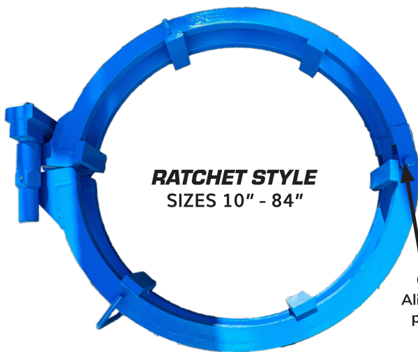
RATCHET STYLE SIZES 10" - 84"

Conveniently placed on the outside to boost weld access and torque for superior tightness.